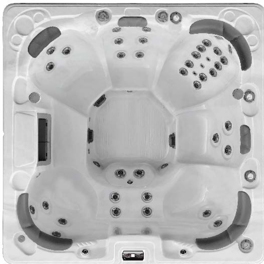
Standard Acrylic Color