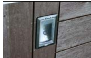
Bluetooth Docking Station

(STB) Bluetooth Audio with Dock (STI2) Infinity™ AM/FM / Bluetooth Audio LED Jets White Package Features