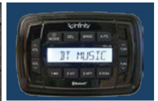
Infinity™ Audio System