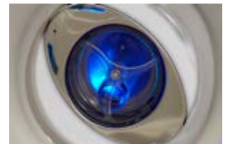
Illuminated Jets / White Package